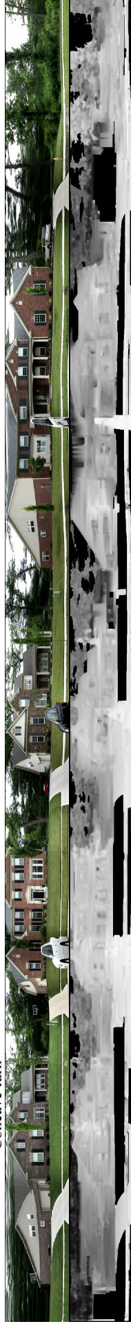
Concave path segment