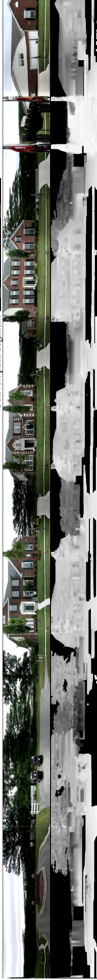
Concave path segment